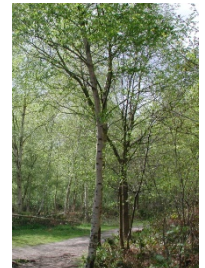
Silver Birch: leaves eaten by 230 insects

Bromley Biodiversity Partnership is a partnership of local groups, organisations and individuals with specific expertise committed to protecting, enhancing and celebrating biodiversity within the London Borough of Bromley.