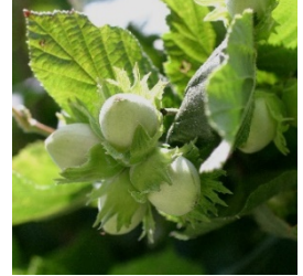
Hazel: leaves eaten by >70 insect species