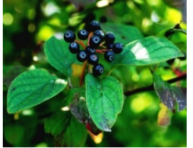
Dogwood: flowers for pollinators, fruit for birds