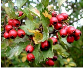
Hawthorn can support 300+ insect species

For more information about what to plant see www.bromleyfriendsforum.org Look under Biodiversity useful documents 'Hedgeplants to improve biodiversity'.