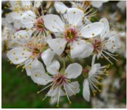
Cherry Plum for early pollinators