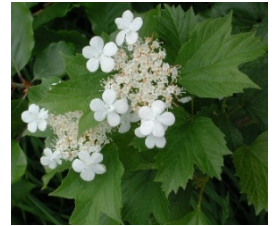
Guelder Rose: flowers for pollinators e.g. hoverflies