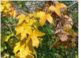
Field Maple: good for pollinators & lichens