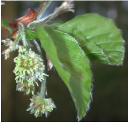
Beech: 64 insect species eat its leaves