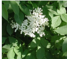
Elder: nectar for insects, fruit for birds & mammals