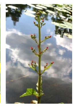
Left to Right: Meadowsweet Marsh Marigold Water Figwort

Animals will find your pond on their own. Do not introduce fish as these will eat eggs and young of frogs, toads and newts.